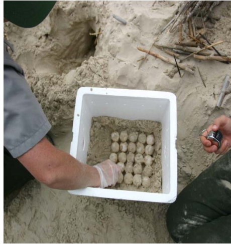
Figure 1. Excavating a nest.