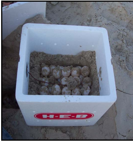
Figure 3. Eggs packed with probe.